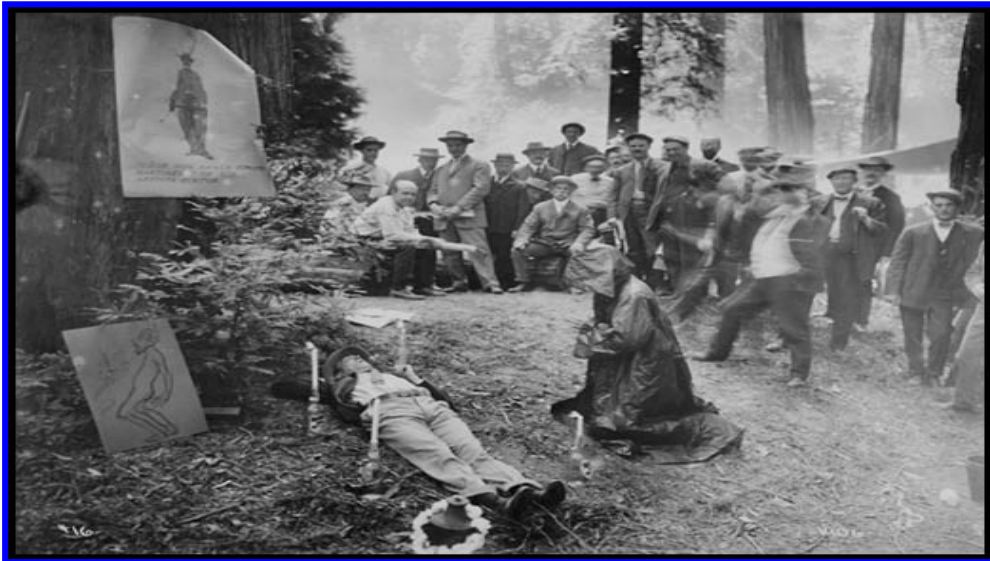
Power Party Photograph by Gabriel Moulin, 1915

This is Moloch, the chief god of the Ammonites and Grove, which is prominently featured at the Grove and where they hold mock human sacrifices.